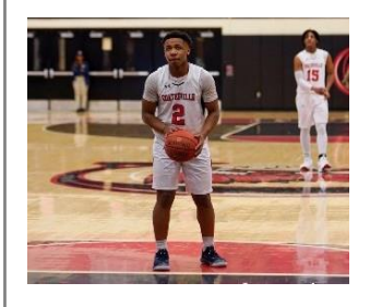
4 March Madness